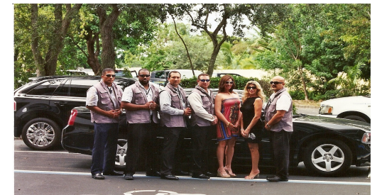
Executive Protection Training Alumni (July 2009)